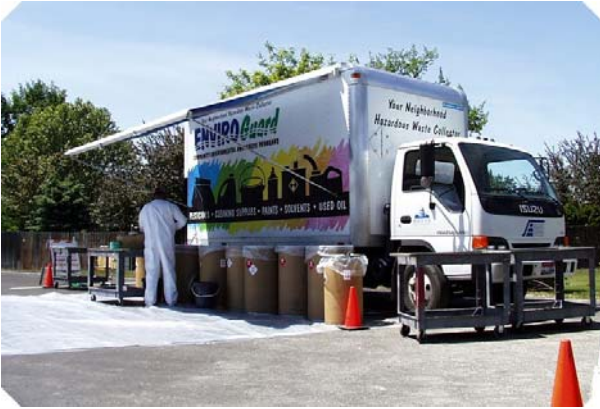
Boise's mobile household hazardous waste collection vehicle—the "EnviroGuard" truck.