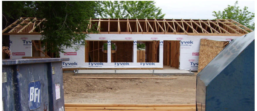
This Habitat for Humanity house is being constructed near Capital High School in Boise.

A family of six will move in to this new home when it is completed in Fall 2006.